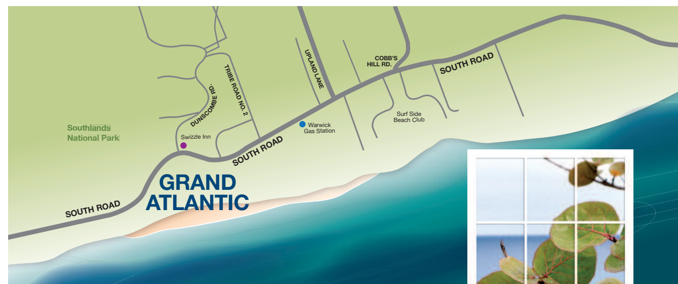
72 South Road, Warwick WK 10, Bermuda