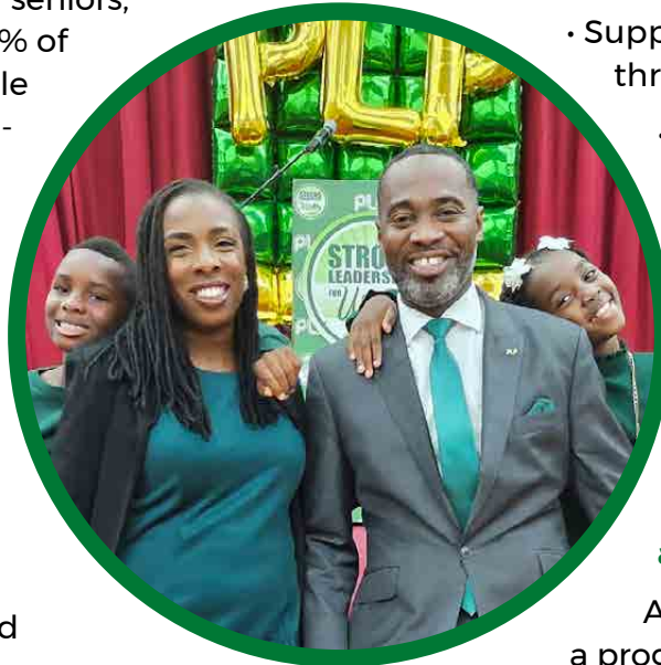
E. David Burt, JP Premier of Bermuda Leader, Progressive Labour Party

Together, we will take the necessary steps to secure a fairer, more stable, affordable, and ultimately a stronger and better future for all.